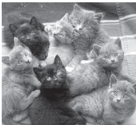
Become a Kitten Rescue Foster.

Every dog would love a foster home while waiting for their forever home. The more foster volunteers Animals Rule has, the more dogs it can take out of the shelter. It's a very rewarding experience. As a foster family, the dog or puppy goes into your home on a temporary basis. Everything is covered... the food, the toys, the vet bills, etc. You supply the love, allow the dog to stay with