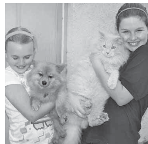
Give a pet a second chance in life.

Some people say, "It would be too tough to let the pet go once it's in my house, I can't do it." Isn't it tougher to know that that without more foster families, a homeless pet may never have the chance for a permanent, loving home? •