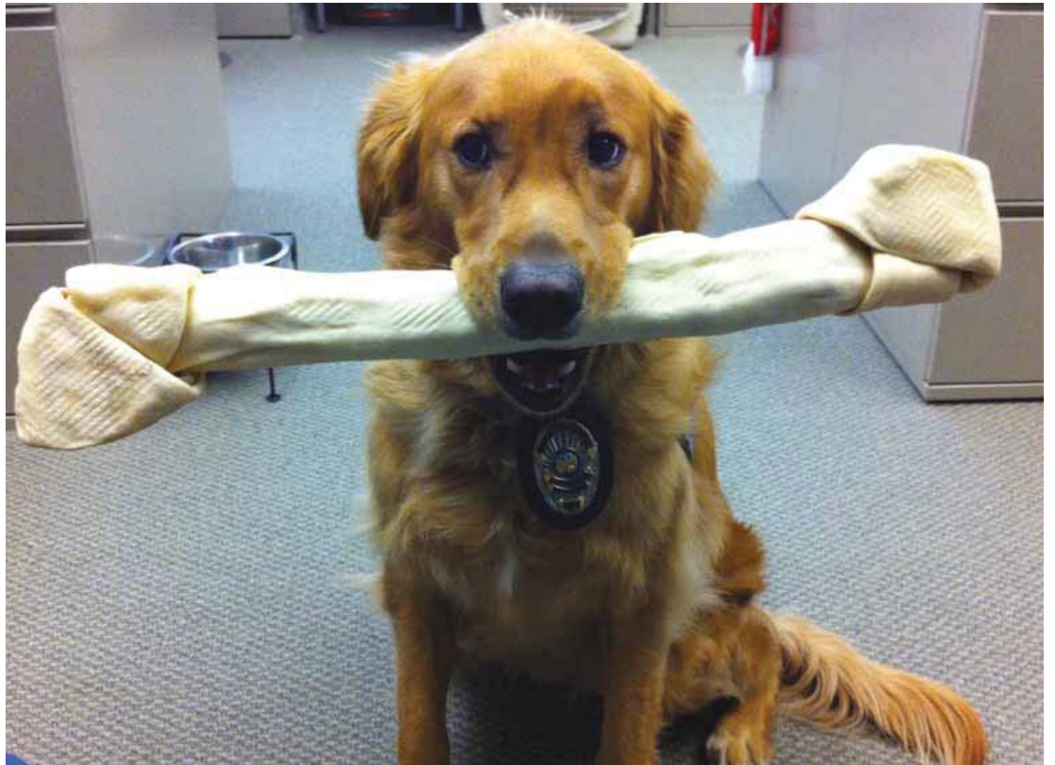
Hawthorne Police Department is asking the community to join them on Thursday May 23, 2013 for the K-9 Community BBQ Dinner. It will be Scottie's first dinner and he would love your support. Hope to see you there!