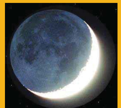
A partial lunar eclipse will take place on April 25, 2013, the first of three lunar eclipses in 2013.