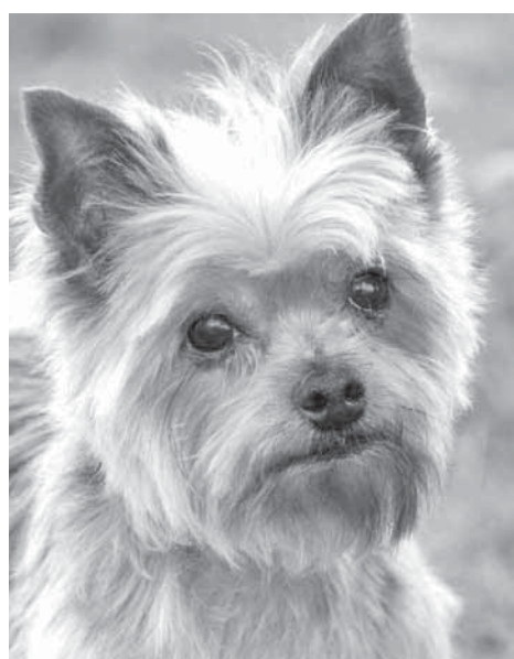
All you do is supply the love.

you during the week and bring the pet back on Saturdays for the adoption events from 11 to 3 p.m. Stop by an adoption event or send an e-mail to info@animalsrule.org if